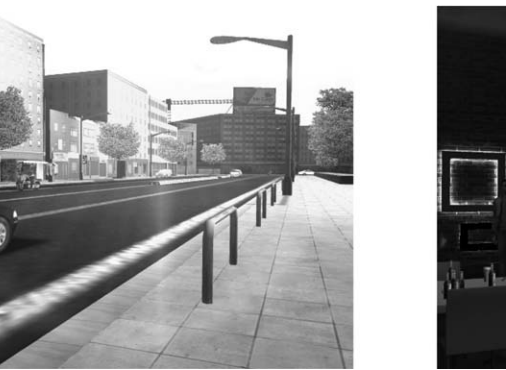
Figure 1. Some captures of the virtual environments.

nology, we also assessed the predictive power of sense of presence.