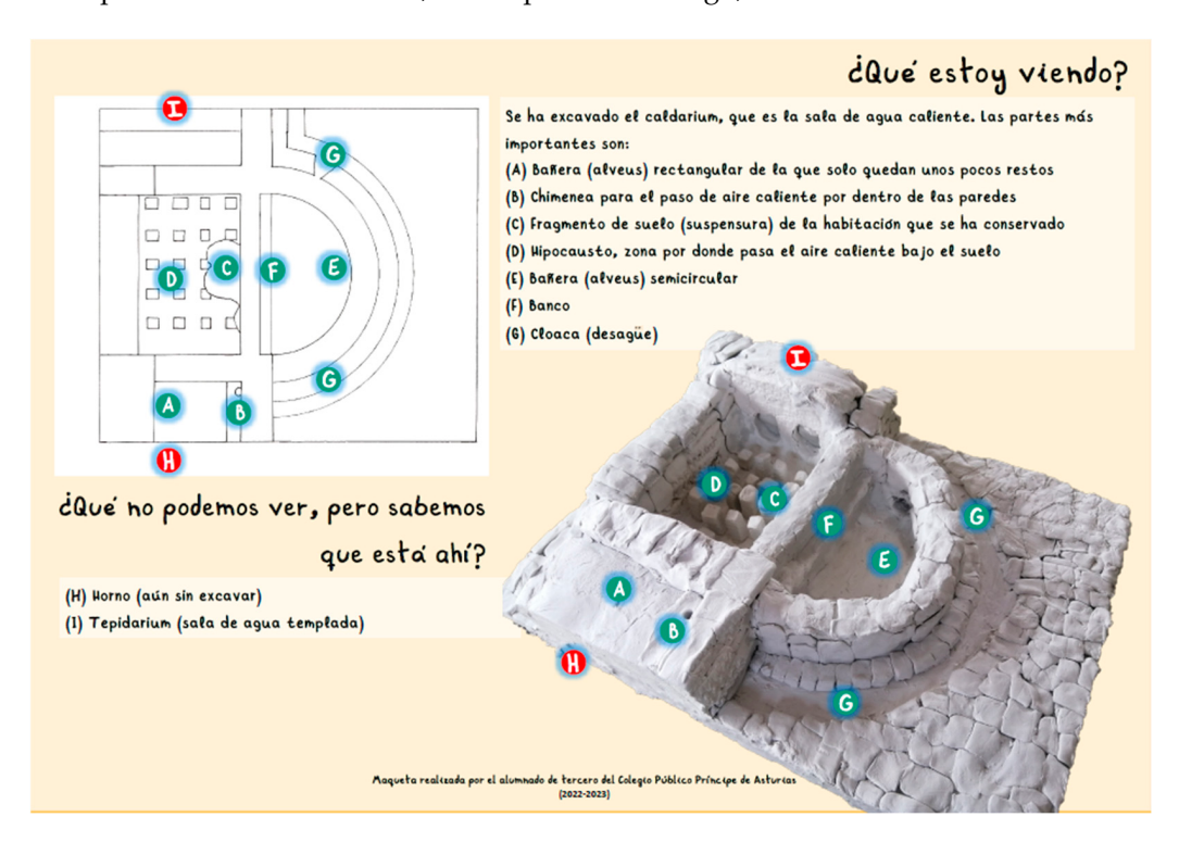
Figure 2. Model information board designed by the participating pupils.

Thus, multiple visits were made to the thermal complex to carry out different tasks, such as the critical analysis of the panels, the observation of the different constructive elements, or the taking of measurements for the creation of a plan and a model, in which the 3rd year primary pupils take part (Figure 2). In addition, different materials are prepared that serve as visual support to use in the making of the new panels, such as the labels for the titles or subtitles, the making of images of the funerary stele or its discoverer, of the parts of the Roman Baths, the map of the borough, etc.