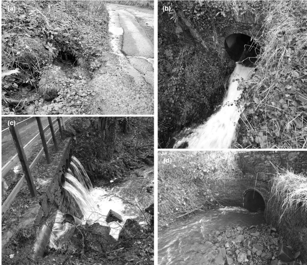
Fig. 3. Examples of culverts on small rivers with high gradients in River Usk catchment, United Kingdom. The culvert in (a) is viewed from the inlet and no outlet was visible; it had been filled with sediment. The culvert in (b) is viewed from the outlet, which is perched several metres above the riverbed. The culvert in (c) has substantial physical degradation, is perched >1 m above the riverbed, as well as erosion and scouring alongside and below the outlet of the structure. The culvert in (d) had moderate physical degradation, particularly scouring at the base of the structure and cracking of stones on the structure.

Fig. 2. Distribution of road-river structure sensitivity (the intersection of gradient and Strahler stream order) and exposure (in relation to built-up areas and special areas of conservation designated for river-obligate species (shown at bottom of image)), where the intersection of high sensitivity and exposure (of any category) indicate vulnerability. Structures posing high risk of impact to the connectivity of rivers and communities (under flooding) intersect at high vulnerability (the intersection of high sensitivity and exposure) and high flooding hazard (where the initial hazard categories of yearly flooding likelihood were low (0.1–1.0%), medium (1.0–3.3%), and high (>3.3%)). All species images were sourced from PhyloPic (phylopic.org): Salmon was created by Timothy J. Bartley and included in this article under a CC BY-SA 2.0 license; Lamprey by Christoph Schomburg, Shad by Felix Vaux, Bullhead by Unknown, and Pearl mussel by Katie S. Collins are all included in this article under CC0 1.0 universal public domain dedication.