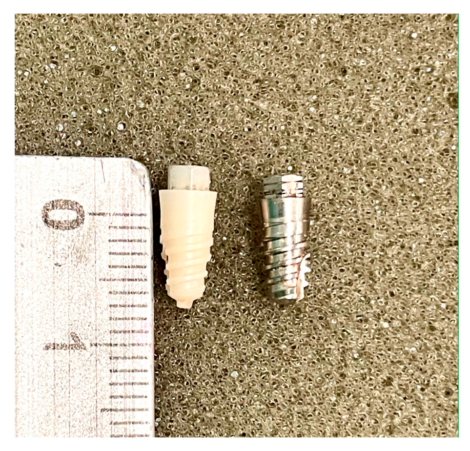
Figure 1. Klockner External Hex SK2 implants, Zr and Ti, both with 3.8*8 buffed surface (Soadco S.L., Escaldes Engordany, Andorra).

The sample consisted of the placement of 21 Zr implants (test) and 21 Ti implants (control group) (n = 42), in another 21 fragments of fresh cow ribs destined for human consumption. We based our selection of the sample size on studies of similar design and objectives [13–15]. The most central part, close to the sternum, was used in all cases in order to have type III bone quality under the Lekholm and Zarb classification [20]. All pieces were cut to a length of 15 cm, and the periosteum was removed. The ribs thus prepared were subjected to a preparation and conservation treatment based on immersion in 50% ethanol and 50% saline at room temperature, to be rehydrated with saline prior to use, according to the Tricio protocol [21]. Klockner SK2 implants (Soadco, Escaldes-Engordany, Andorra) were used, connected by an external hexagon 3 mm wide and 1.8 mm high, smooth collar 1.5 mm high and 4.2 mm platform diameter, bone body of 3.8 mm diameter and 8 mm in length, and machined surface, without additional modifications (Figure 1).