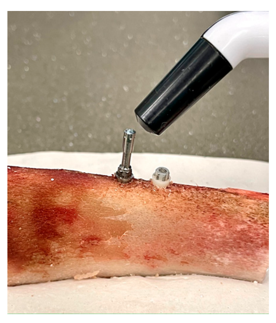
Figure 3. Measurement of implant stability by resonance frequency analysis using a Penguin and its Multipeg transducer screwed to the TI implant, expressed in ISQ values. On the right, the Zr implant placed in the same rib can be seen.