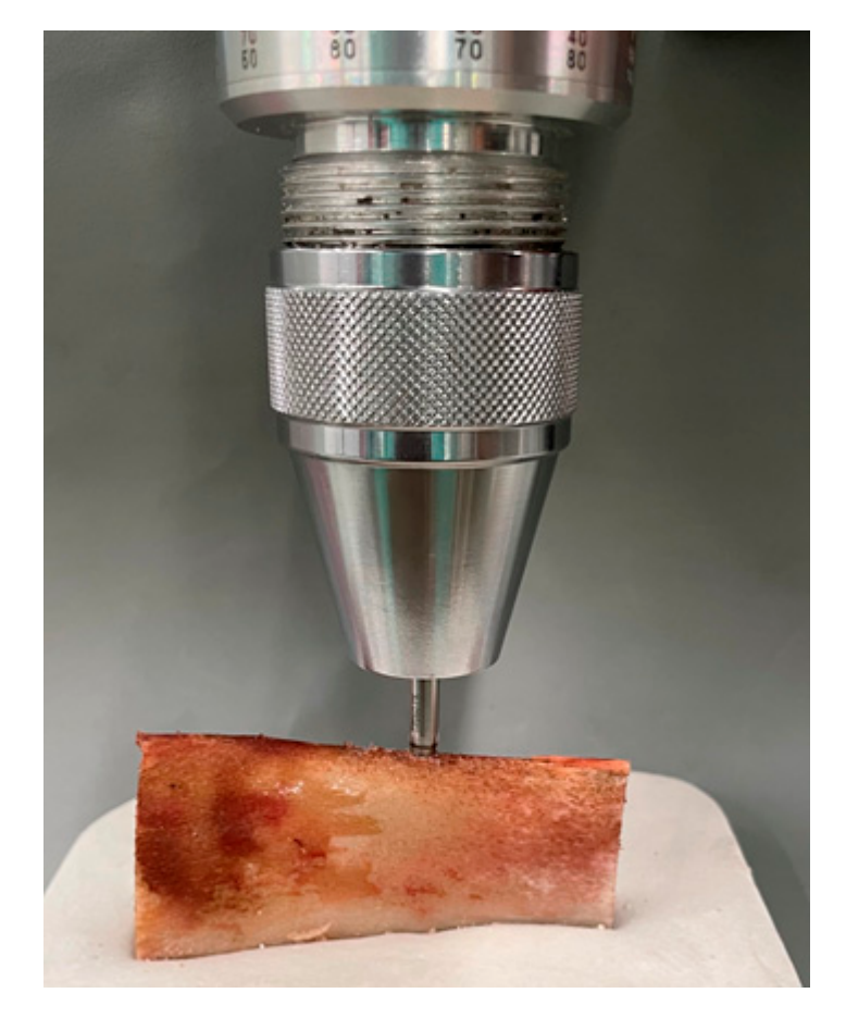
Figure 2. Placement of the implant, in the surgically shaped bone bed, using a calibrated torque meter, to record the insertion torque in Ncm.

A previously calibrated BTG90CN analog torque meter (Tohnichi, Tokyo, Japan) was used (Figure 2), which measured the insertion torque (in Ncm) required to bring the implant to its final position, which in all cases was left with the smooth collar of the implant placed supra-crestally.