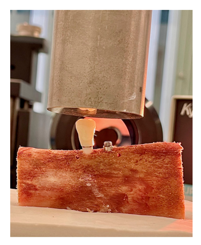
Figure 5. Detail of the PMMA crown screwed on the external hexagon of the Zr implant, and mounting on the MTS Bionix 358 test machine. In the background you can see the lens of the Questar QM-100 long-distance microscope.

Figure 4. Questar QM-100 long-distance microscope focused on one of the implants in the sample. In the background you can see a rib mounted on its plaster base and mechanized on the base of the load creep machine.