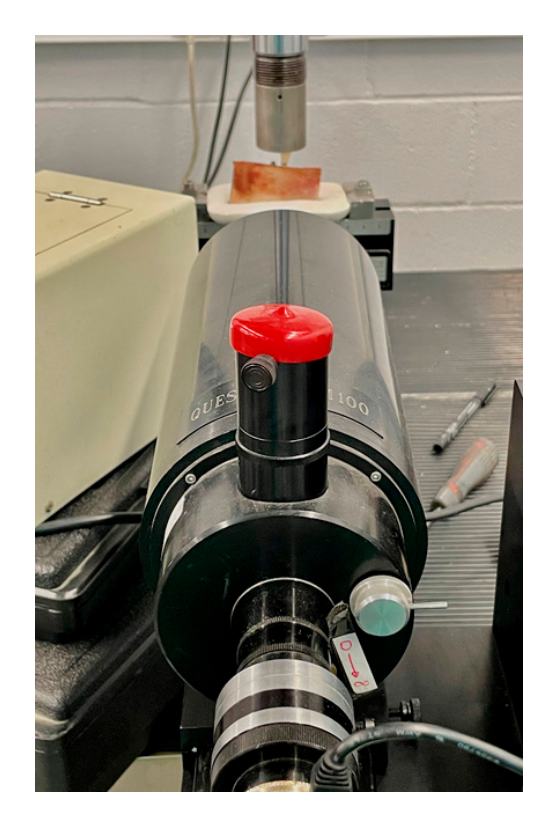
Figure 4. Questar QM-100 long-distance microscope focused on one of the implants in the sample. In the background you can see a rib mounted on its plaster base and mechanized on the base of the load creep machine.