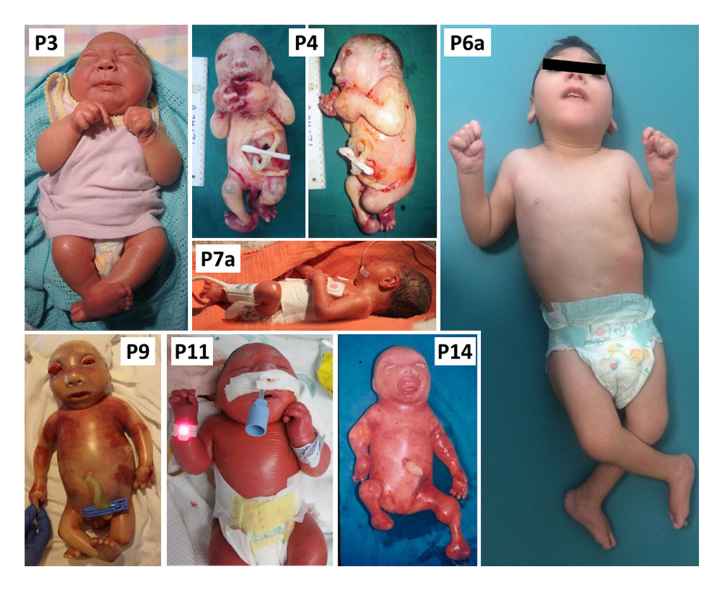
FIGURE 2 Clinical photographs documenting the phenotype in selected cases of this cohort. Variable clinical presentation of several patients as newborns (P3, P4, P7, P9, P11, P14) and at the age of 3.5 years (P6a). Patient ID is indicated on the top of the respective photos

and appeared to correlate with the degree of microcephaly and skin involvement (Tables \,1\, and S4).