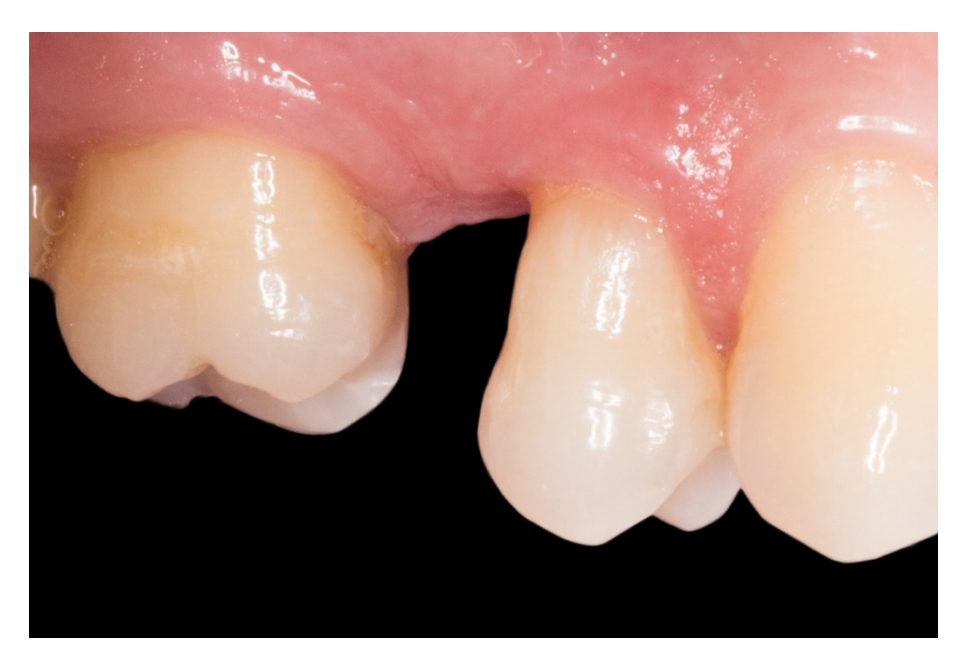
Figure 1. A posterior maxilla edentulous space.

The follow-up of the restorations reported here stopped by the end of June 2019. Restoration procedures were explained to the patients, and the 21 patients who accepted this protocol were treated by 2 operators as follows (Figures 1–8):