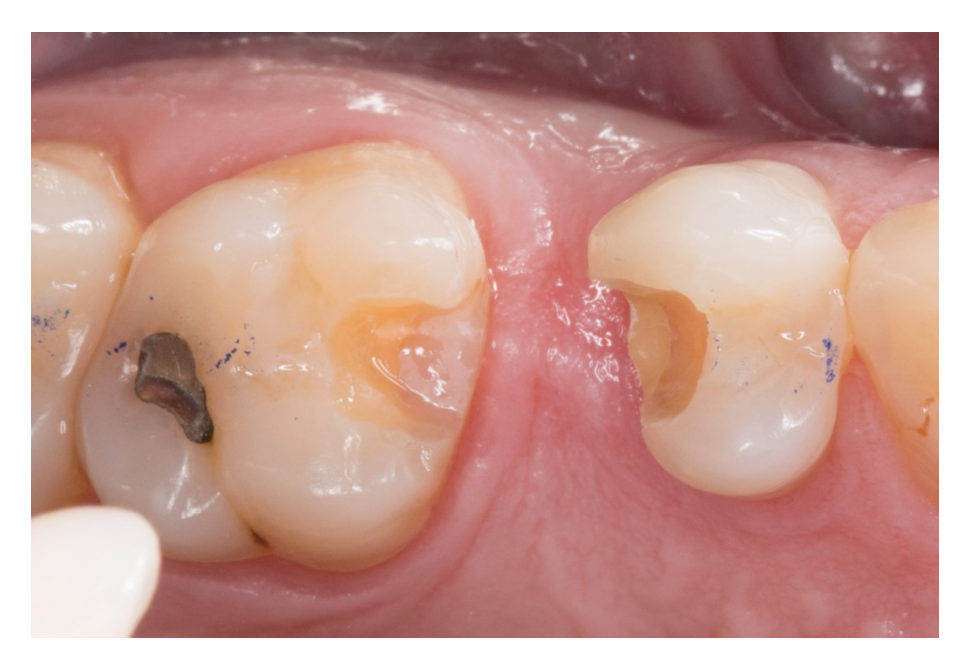
Figure 2. The proximal faces of the adjacent teeth delimiting the edentulous space carved up to the level of the ideal point of contact (inlay cavities).