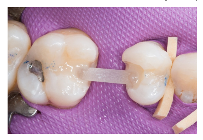
Figure 4. The horizontal fiberglass pin bonding to the adjacent teeth.