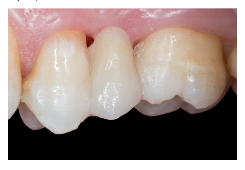
Figure 7. The FRCB after the occlusal adjustment and composite polishing.