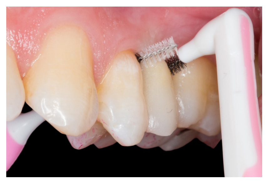
Figure 8. The embrasures are released allowing adequate interproximal brushing, avoiding periodontal disease and interproximal caries.