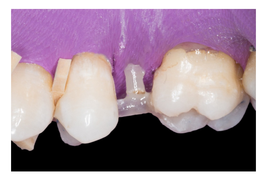
Figure 5. "T" shape of the fiber-reinforced composite bridge.