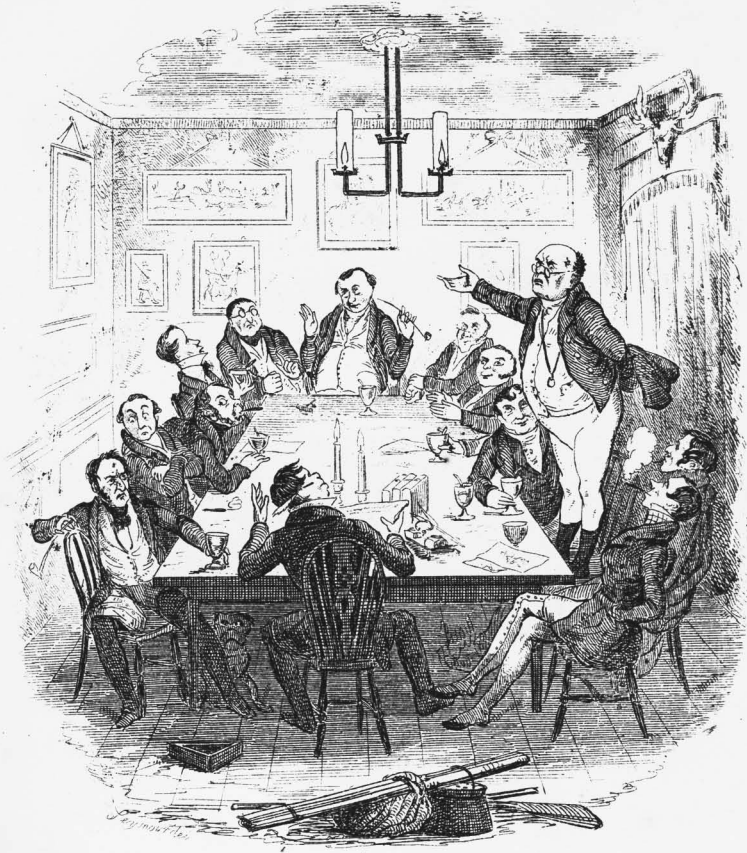
Mr. Pickwick addresses the club.