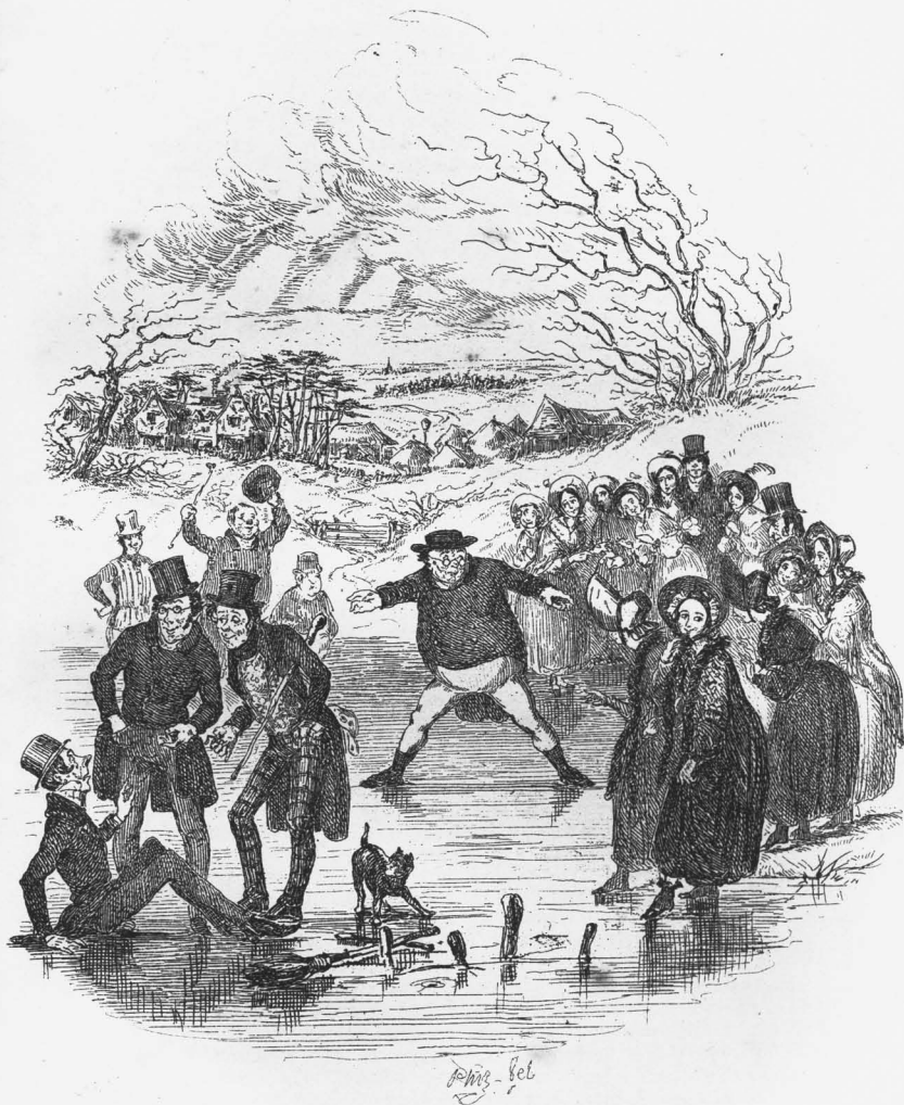
Mr. Pickwick slides.