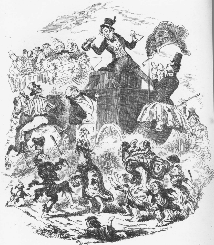
Mr. Bob Sawyer's mode of travelling.