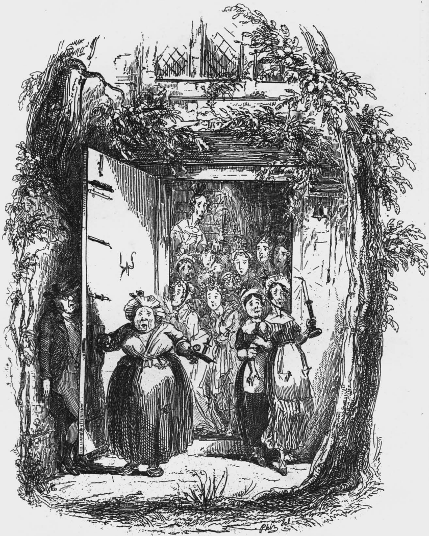
The unexpected 'breaking up' of the Seminary for young ladies.