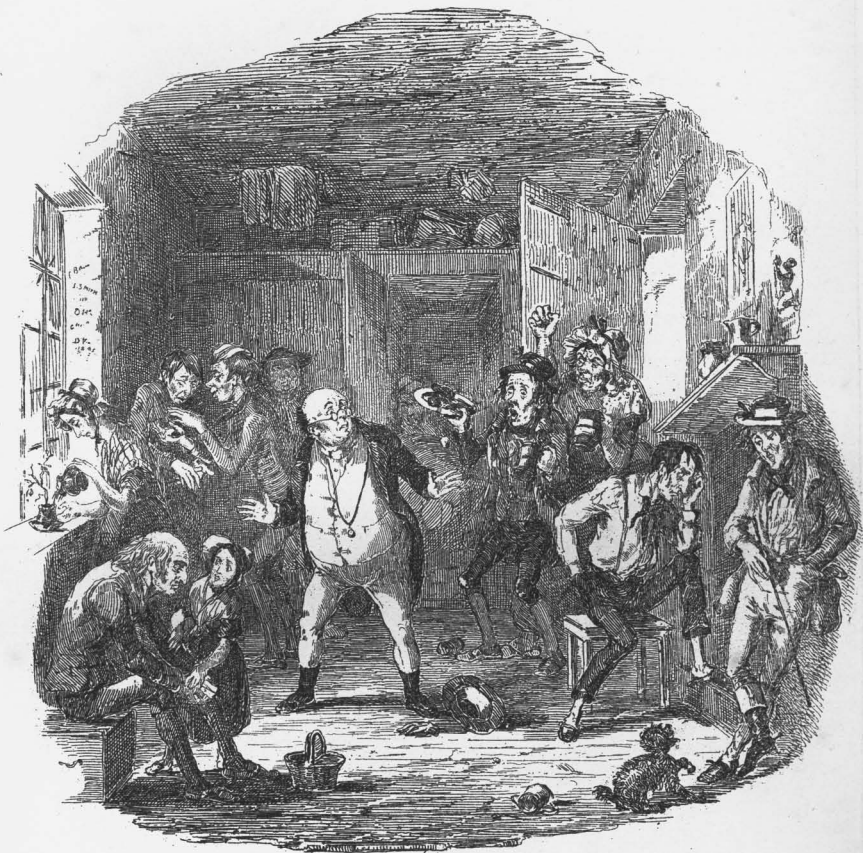
Discovery of Jingle in the Fleet.