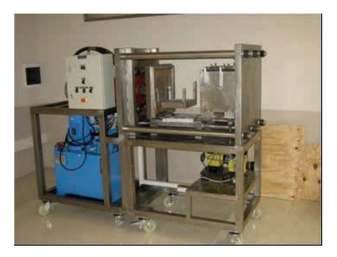
Figure 4. ROCKTESTCO, test equipment.

The entire assembly approximately weighs 1 300 kg. This equipment includes a cabinet where both switches activation of different elements by the user, such as electrical control elements and protections necessary to ensure the safety of the people and the equipment according to current regulations (Figure 4).