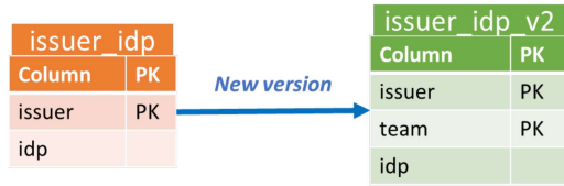
Figure 1: Previous and new version of issuer_idp

To maintain data integrity, each row of “issuer_idp” must be migrated to “issuer_idp_v2”, adding the appropriate value for column ‘team’ to complete each row. Values of column ‘team’ must be obtained from table “idp” as it is displayed in Figure 2.