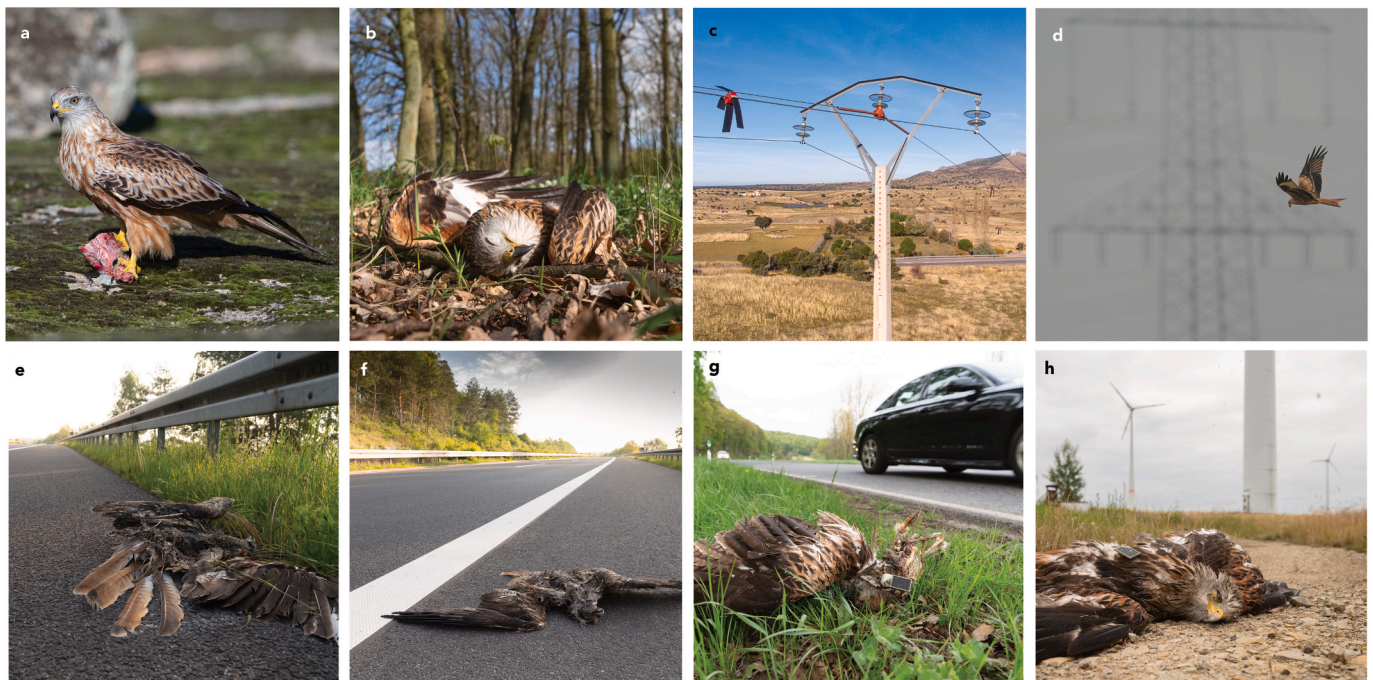
Fig. 2. Anthropogenic sources of mortality for red kites: (a) and (g) consumption of poisoned baits; (b) collisions with power lines; (f) electrocution at electric pylons; (c), (d), and (h) collisions with vehicles; (e) collisions with wind turbines.

human-mediated food, including livestock carcasses and other waste, could induce declines in reproduction during the breeding season and elevated mortality during the non-breeding season (Blanco, 2014; Blanco et al., 2017; Fulco et al., 2015; Pitarch et al., 2017). Disturbances around nests and habitat destruction might cause severe impact in local populations through reduced reproduction or reduction in the number of breeding territories (Carter, 2007; Davis and Davis, 1981; Seoane et al., 2003; Viñuela et al., 1999), which may be partly attributed to high breeding fidelity (e.g., using the same territory for up to 18 consecutive years; Ortlieb, 1989).