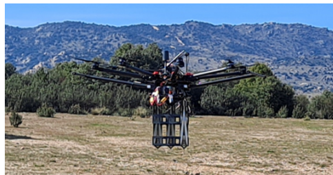
Fig. 1. Image of the UAV-mounted GPR system during the test flight.

flight path, sending the geo-referred radar measurements to a ground control station in real time. These measurements are processed to retrieve a 3D radar image using a SAR algorithm.