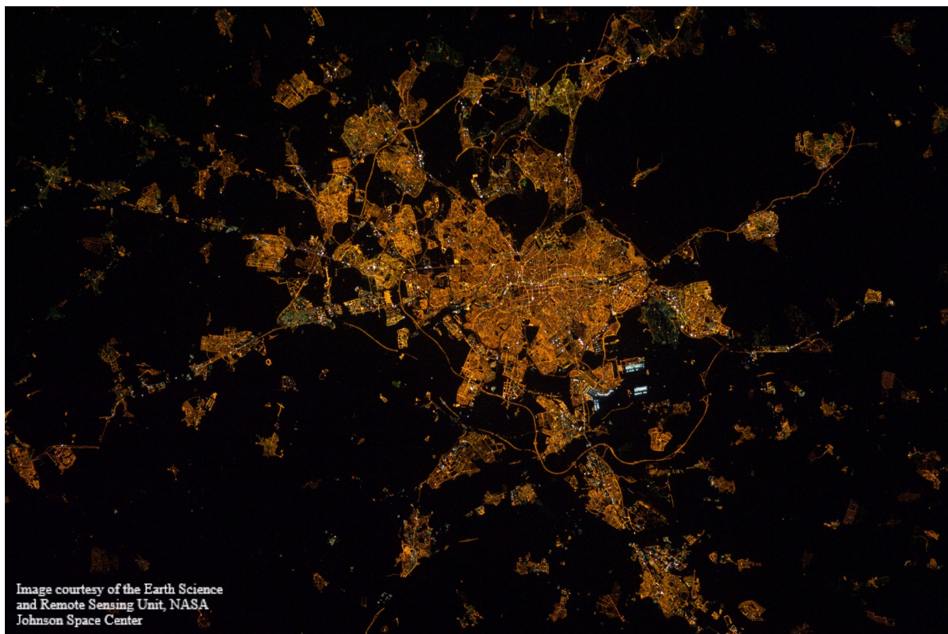
Figure 1. International Space Station night image of Madrid 12 February 2012, time: 02:22:46 GMT (local time 03:22:46) (ISS030-E-82052; NASA Johnson Space Center; https://eol.jsc.nasa.gov ).

We also calculated an index of outdoor blue light spectrum using an approach described in Aubé et al. (2013) to calculate the melatonin suppression index (MSI) at each pixel of the image. The MSI is related to exposure to blue light and is a metric