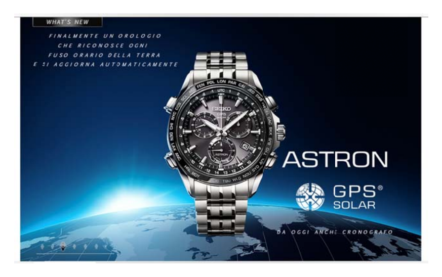
Figure 6. Seiko Astron. Italian website.<sup>12</sup>

Revista de Lenguas para Fines Específicos 22.2 ISSN: 2340-8561