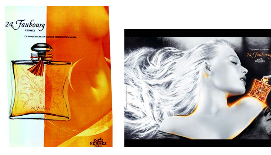
Figure 2. Global campaigns, use of French for fragrances.

In the next example (Figure 2), however, although it also reflects a strategy of global marketing, French is used as a lingua franca instead of English.