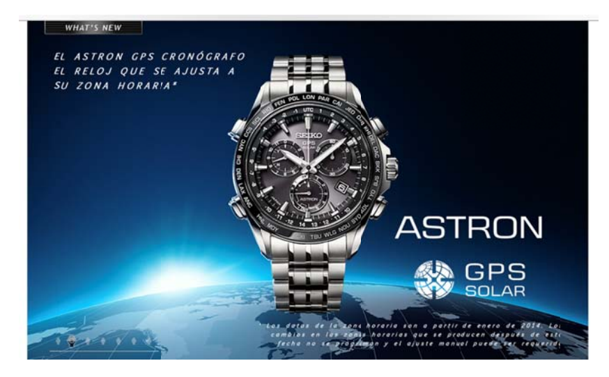
Figure 5. Seiko Astron. Spanish website.<sup>11</sup>

and Djokovic, making them both global elements, with some shared features associated to them. Unlike the television commercial, the rest of promotional material for the Seiko watches in the international websites has been localized, as can be seen in the Spanish version for the Latin American site (Figure 5) and in the Italian version for Italy (Figure 6).