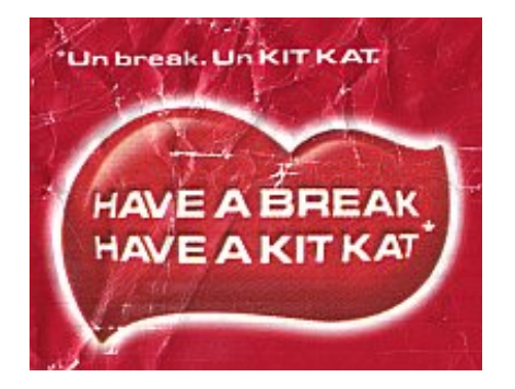
Figure 3. Application of Toubon Law<sup>6</sup>.

As we have above-mentioned, institutional norms, attached to particular contexts and systems, have a direct effect on language policies as well, as is the case in France with the Law Toubon<sup>5</sup>, enacted in 1994, which has served to protect the use of the French language opposing the invasion of English expressions in different social areas, including administrative documentation and promotional material. This Law has had immediate effects on advertising, ensuring that, whenever a slogan or tagline appears in another language rather than French, this has to be translated in French as well. Figures 3 and 4 present a few examples: