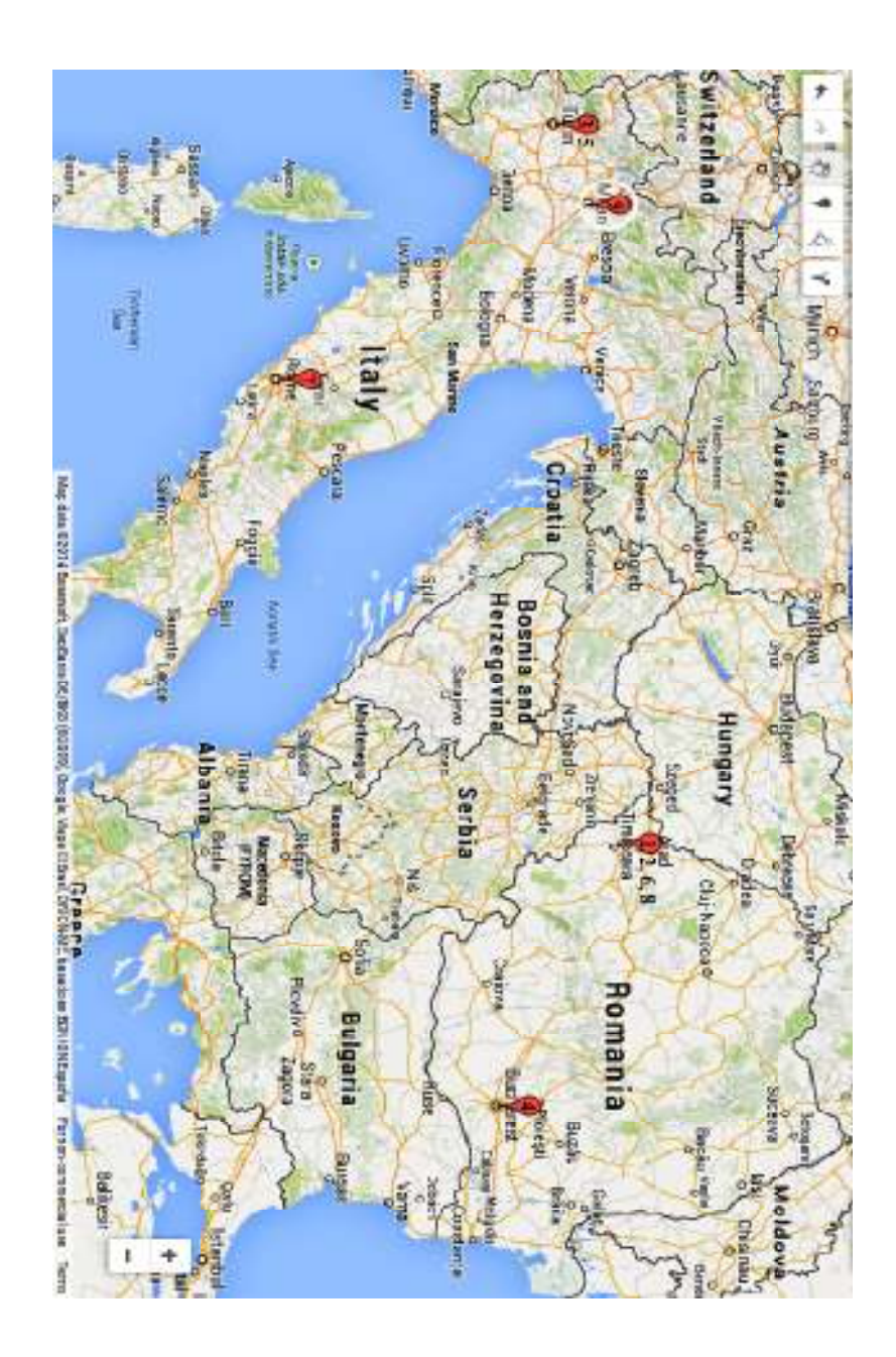
Fig. 2. Interviewees' current location.