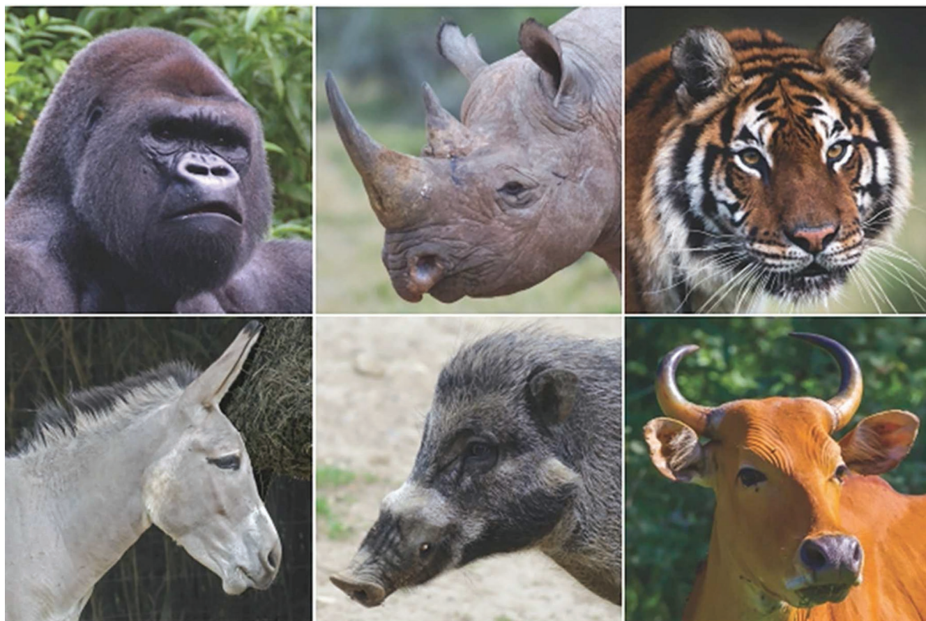
Figure 2. Photographic examples of threatened megafauna. Top row left to right: photos of well-known species, including the Western gorilla ( Gorilla gorilla ) (CR), black rhino ( Diceros bicornis ) (CR), and Bengal tiger, ( Panthera tigris tigris ) (EN). Bottom row left to right: photos of lesser-known species, including the African wild ass ( Equus africanus ) (CR), Visayan warty pig ( Sus cebifrons ) (CR), and banteng ( Bos javanicus ) (EN).

imperiled (tables S1 and S2). Most of the world's megaherbivores remain poorly studied, and this knowledge gap makes conserving them even more difficult (Ripple et al. 2015).